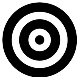
Public Sector Integrity