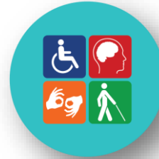
Programs and Services for Persons with Disabilities