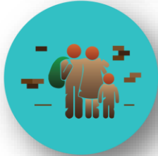
Comprehensive Program for Street Children, Street Families and Indigenous People