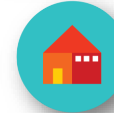
Residential and Non-Residential Care Program