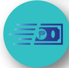
Unconditional Cash Transfer (UCT) Program