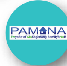
Payapa at Masaganang Pamayanan (PAMANA) Program