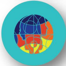
International Social Welfare Services for Filipino Nationals (ISWSFN)