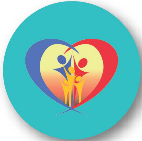
Pantawid Pamilyang Pilipino Program (4Ps)