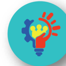
Development of Social Technologies