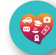
Assistance to Individuals with Crisis Situations (AICS)