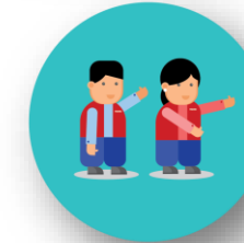
Technical Assistance and Resource Augmentation (TARA) Program