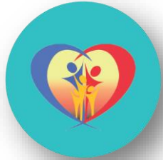
Pantawid Pamilyang Pilipino Program (4Ps)