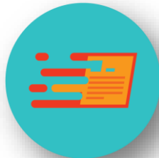
Travel Clearance for Minors