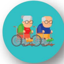
Centenarians Act Implementation