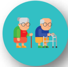
Social Pension (SocPen) for Indigent Senior Citizens