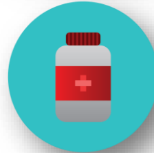
Lingap at Gabay Para (LinGaP) sa May Sakit