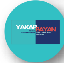
Yakap Bayan After Care Program