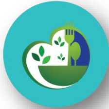
Supplementary Feeding Program (SFP)