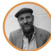
MARTIN FOWLER THOUGHTWORKS