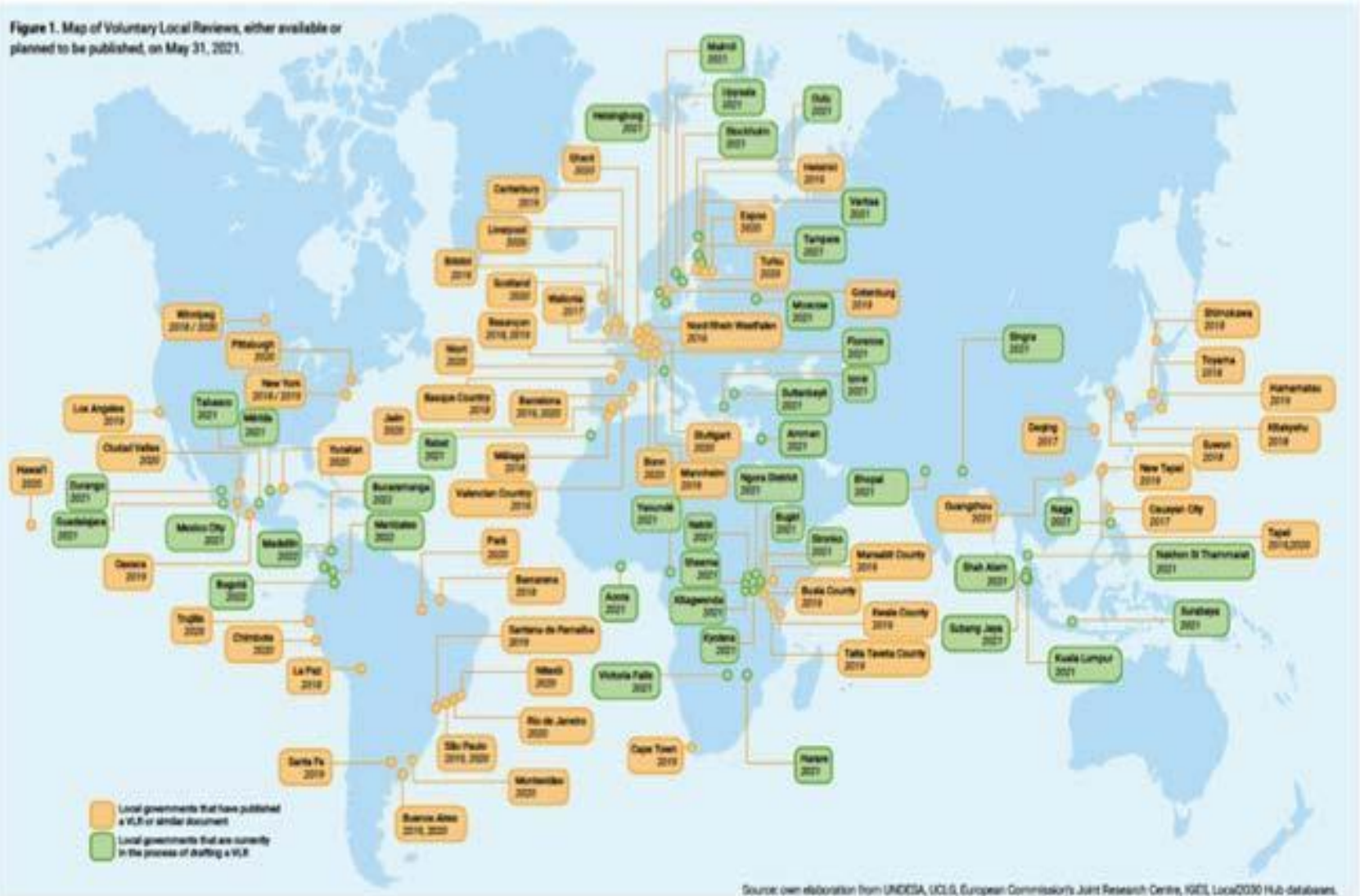
Figure 1. Map of Voluntary Local Reviews, either available or planned to be published, on May 31, 2021.